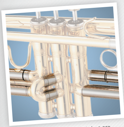
Nickel silver outer slide tubes are remarkably durable and easy to operate