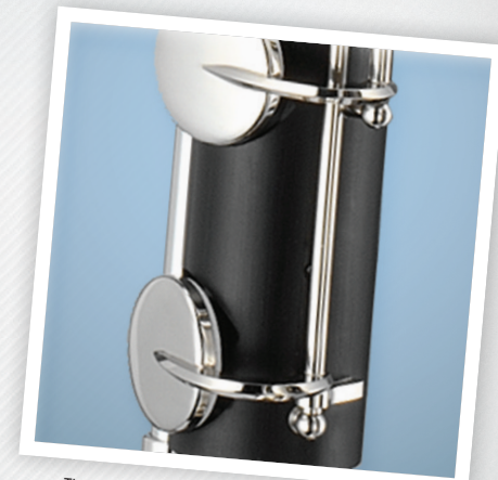
The low Eb key on the JBC1000 is mounted on the body of the instrument, protecting the key mechanism and stabilizing proper key regulation.