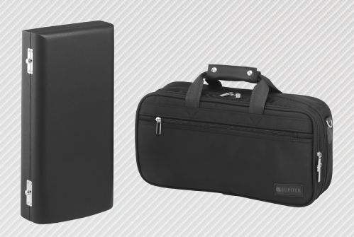
The JCL1100S includes a French-style case with cover that offers both stylish appearance and lightweight protection.

The 700 Series is the new standard for the beginning clarinetist. Available in both Grenadilla Wood and ABS body materials, these instruments are built to produce a full, rich tone quality with exceptional intonation and playability.