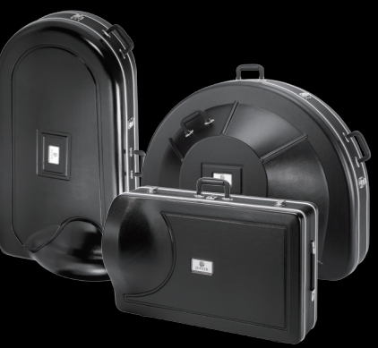
All Jupiter marching brass models come with durable hard shell cases.

Choose the best model for your needs. From brass, to fiberglass, to FiberBrass, three valve to four, Jupiter has the quality, selection and value to fit your performance and budget.